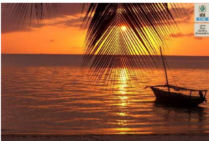
Sunset in Zanzibar, Tanzania