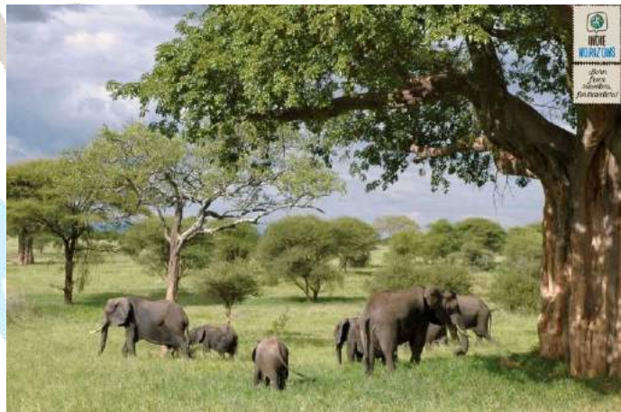
Elephant herds, Tanzania