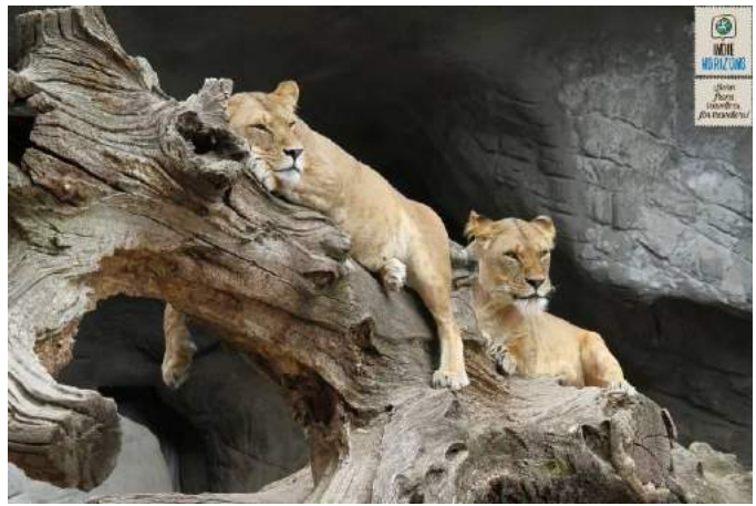
Tree climbing lions, Tanzania