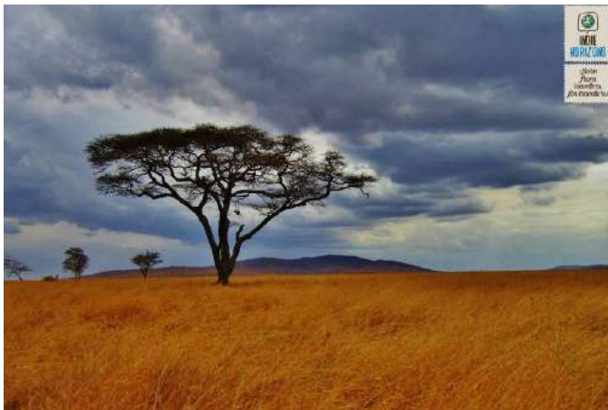
Acacia tree in Serengeti, Tanzania